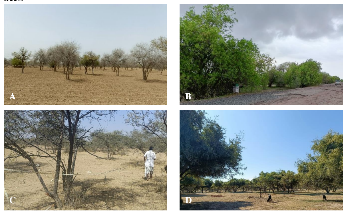
Fig.4 (A) Identified population of Tecomella undulata at Paboosar; (B) Identified population of Salvadora persica at Tal Chappar, Churu; (C) Laying down of quadrant at Dandli, Sindari for Zizyphus nummularia ; (D) Identified population of Zizyphus nummularia at Degrai Mata oran, Jaisalmer

Exhaustive surveys were carried out in Jodhpur, Jalore, Pali, Sirohi, Nagaur, Jaisalmer, Barmer, Bikaner and Churu Districts of Rajasthan for the identification of natural stands of Prosopis cineraria, Tecomella undulata, Zizyphus mauritiana, Zizyphus nummularia, Salvadora persica and Salvadora oleoides. Identified the natural stands of Tecomella undulata (Paboosar, Nagaur, IGNP Bikaner and Mohangarh, Jaisalmer), Salvadora persica (Tal Chappar Churu,), Salvodora oleoides (Leel ki Beed, Churu and (Lakhetli) Bayatu, Barmer), Prosopis cineraria (Mohangarh, Jaisalmer and IGNP Bikaner), Zizyphus nummularia (Sindhari, Barmer, Degraimataoran, Dabla Jaisalmer and Jorbed, Bikaner). Quadrants of 50*50 cm were laid down at each of the identified sites and recorded the morphological data (GPS location, Height, diameter, crown, no of branches, health, flowering and fruiting percentage) for each of the trees.