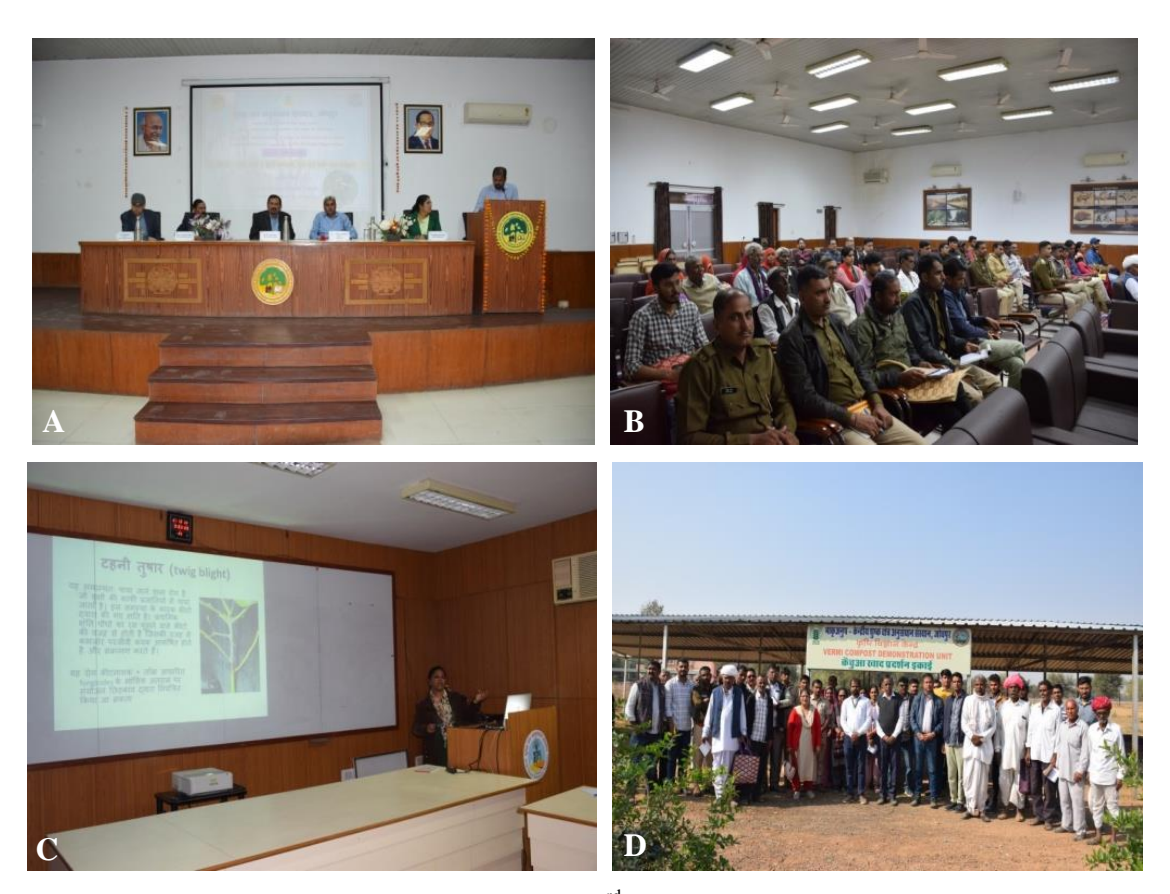
Fig. 8 (A-D) VVK Training during 21-23<sup>rd</sup> Dec, 2023 at ICFRE-AFRI, Jodhpur