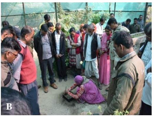
Fig. 12 (A-B) VVK Udaipur training at ICFRE-AFRI, Jodhpur during 21-23<sup>rd</sup> Dec, 2022