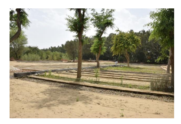
Fig. 7 Cemented construction of water channel at IGNP area, Mohangarh, Jaisalmer (Raj)

Maintenance works of Hi –Tech nursery Bichhwal, Bikaner have been executed and Agroshed net (50%) for net house (size 8×32 m), polysheet, G.I. profile with spring, nut etc. were fitted and made operational.