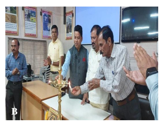
Fig. 10 (A-B) VVK training at KVK Rajkot during 1-3<sup>rd</sup> Nov, 2022