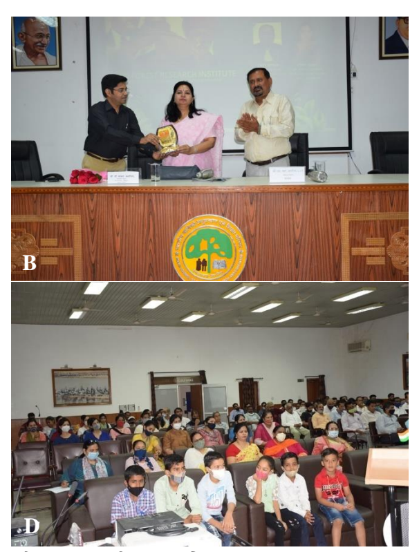
Fig. 20 (A-D) डॉ. भीमराव अम्बेडकर जयंती का आयोजन.

4.11 Extension Activities performed under CAMPA Extension (this information is different from the information provided in the Chapter as above)