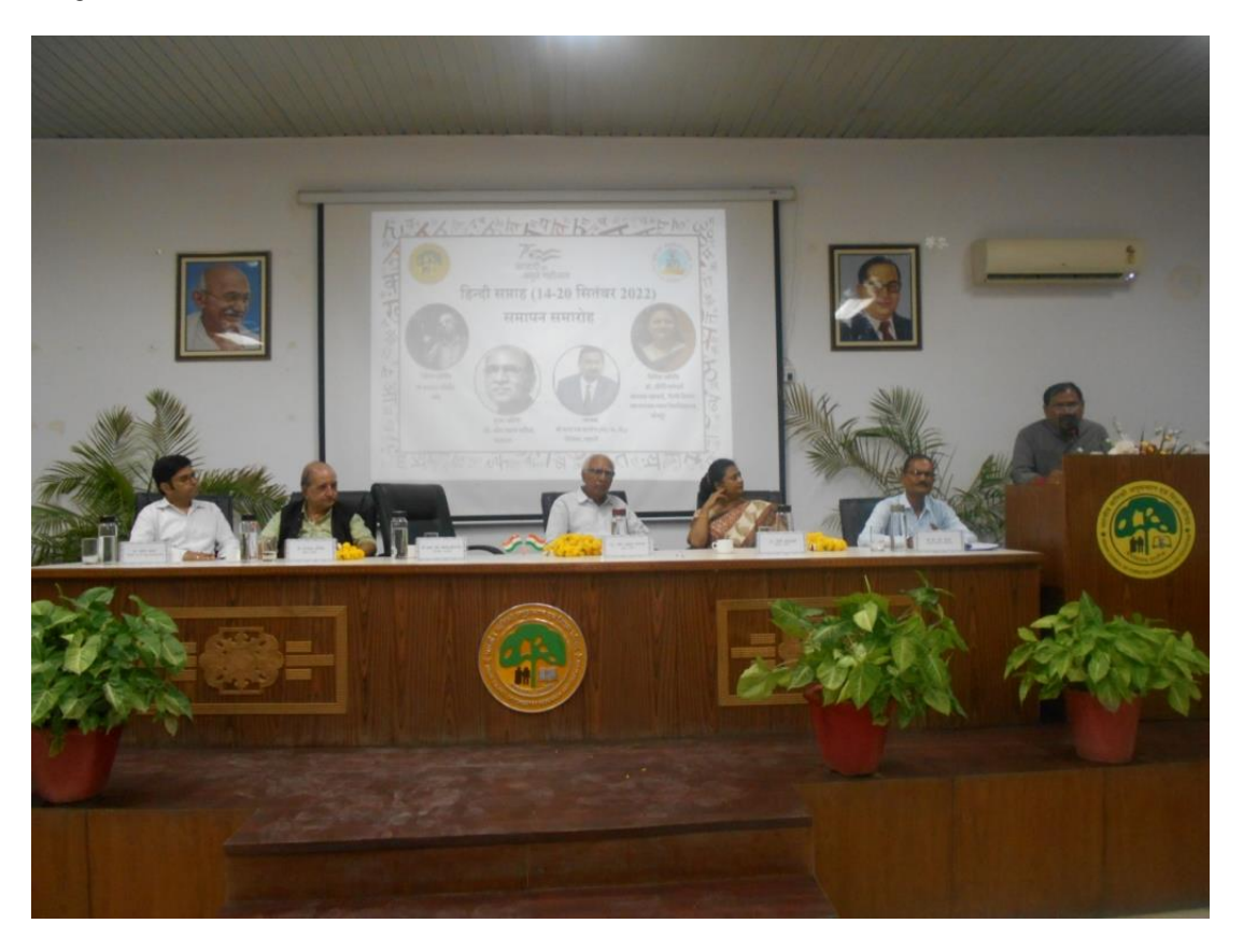
Fig. 19 हिंदी सप्ताह का समापन समारोह 2023.

इसके अतिरिक्त इस संस्थान में नियमित रूप से प्रत्येक तिमाही में विभागीय राजभाषा कार्यान्वयन समिति की बैठक का आयोजन हुआ तथा कार्मिकों में हिन्दी में कार्य करने को बढ़ावा मिले इस हेतु समय -समय पर हिन्दी कार्यशालाएं भी आयोजित हुईं।