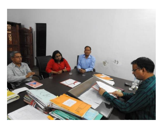
Fig. 11 Meeting between ICFRE-AFRI official with DFO, Udaipur (VVK nodal officer), Udaipur on 26^{th} May, 2022

A meeting was conducted between ICFRE-AFRI and RFD to renovate Agroshed house, capacity building, development of demonstration centre at Kalka Mata Nursery, Udaipur.