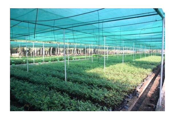
Fig. 9 Renovation of R & D Nursery Rajkot, Gujarat

Excavations of foundation, CPVC pipe, different diameter of LLDPE pipe, sprinkler and its accessories were purchased and completely fitted for irrigation purposes in 4 old Net Houseat R & D Nursery, Chhipardi Biddi, Rajkot and made operational.