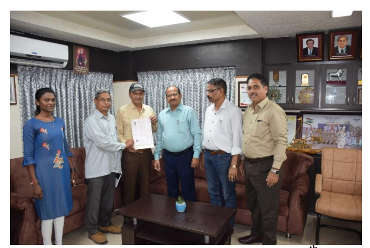
Fig. 13 Signing of MOU with KVK, Vyara on 12<sup>th</sup> Sept, 2022