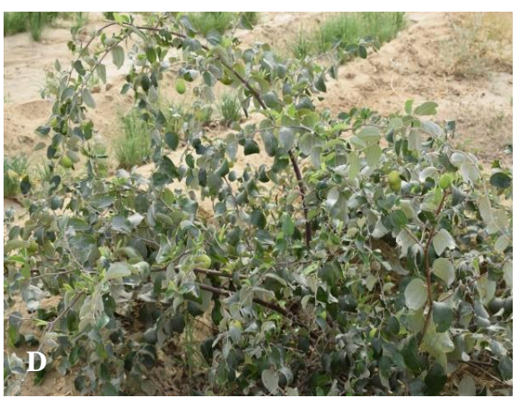
Fig.2 (A) Agri-silvi trial at RMM, Ramgarh, IGNP command area, Jaisalmer; (B) Dalbergia sissoo planted on Boundary at RMM, Ramgarh, IGNP command area, Jaisalmer; (C) Plantation of Agri-horti trial at RMM, Ramgarh, IGNP command area, Jaisalmer; (D) Fruiting in grafted Zizyphus mauritiana in Agri-horti model at RMM, Ramgarh, IGNP command area, Jaisalmer

2.2.4 Forest Soils & Land Reclamation: Nil