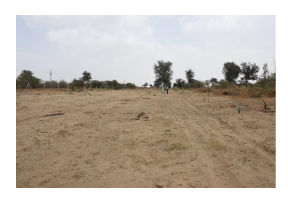
Fig. 14 Guggal clones plantation at Demo village, 1445 RD, IGNP area, Mohangarh, Jaisalmer

DV site was protected and maintained. Signage boards were made and fixed at Demo Village, Mohangarh, Jaisalmer. Demonstration plot of Guggal (43 clones) was planted (1 ha) and maintained. Earth work for irrigation Channel was constructed.