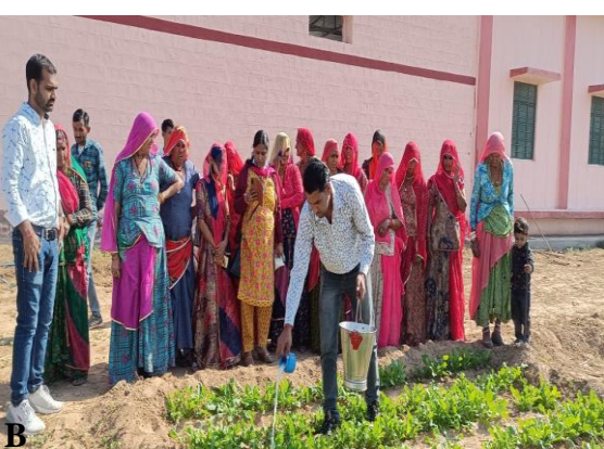
Fig. 6 (A-B) Trainings given to rural women of Rajasthan on use of biofertilizers.