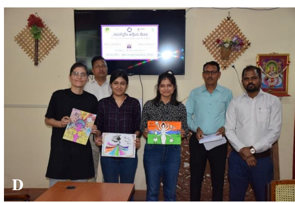
Fig. 21 Celebrations held on Women's Day at ICFRE-AFRI, Jodhpur