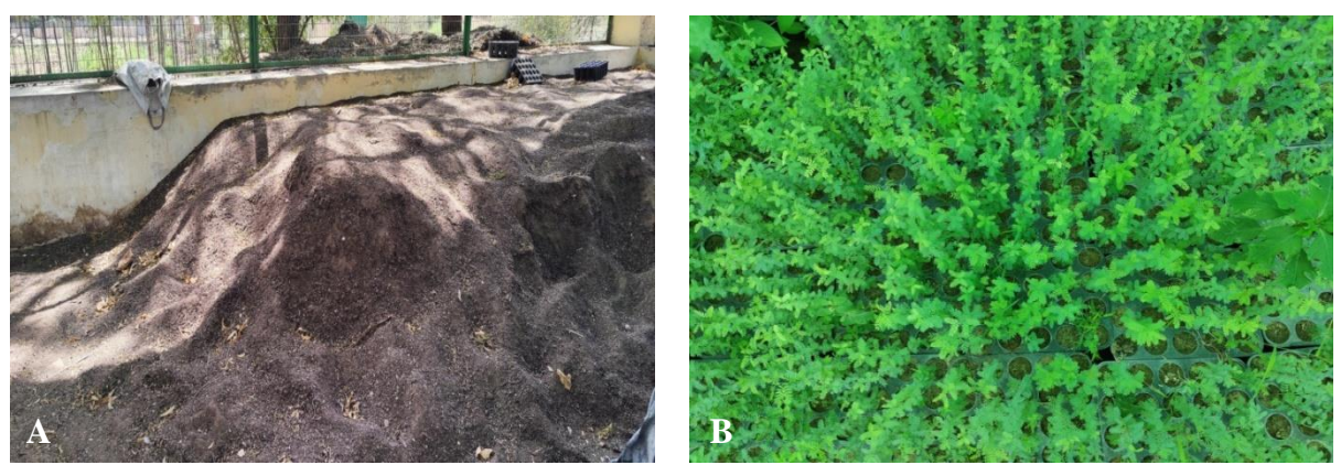
Fig. 18 (A) Compost preparation and its value addition at Nursery; (B) Seedlings Growing in Nursery

added, packed in different size packets and supplied to stakeholders. Total Rs.16,00,000/-income generated from ICFRE-AFRI nursery by selling various saplings, compost and value-added compost.