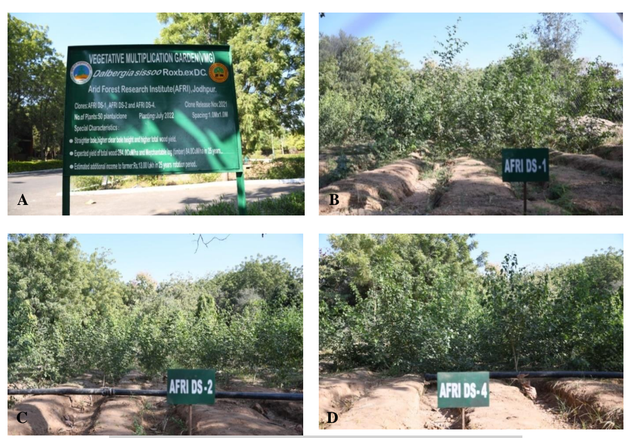
Fig. 17 (A-D) Shisham clones planted at ICFRE-AFRI, Jodhpur

Two Vegetative multiplication Gardens (VMGs) of the newly released clones of Dalbergia sissoo viz., ICFRE-AFRI-DS-1, ICFRE-AFRI-DS-2 and ICFRE-AFRI-DS-4 have been established (0.1 ha each) at ICFRE-AFRI main Campus and ICFRE-AFRI Model Nursery during July, 2022and October, 2022, respectively.