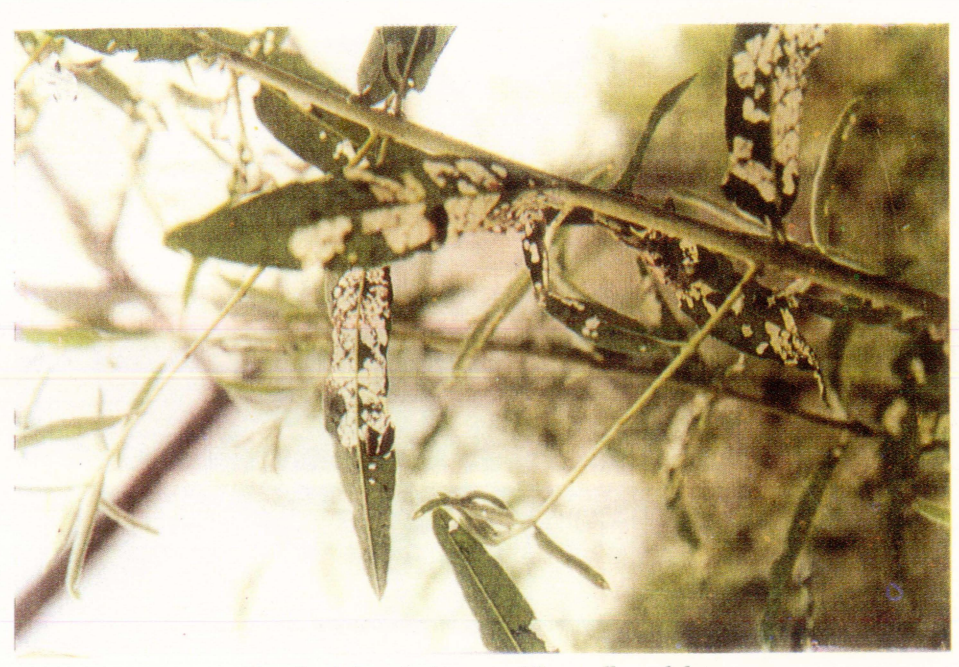
Heavily skeletonized leaves of Tecomella undulata