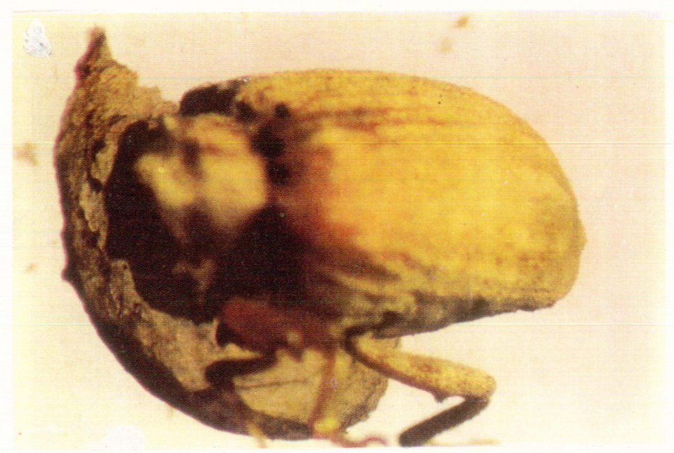
Adult of Patialus recomella