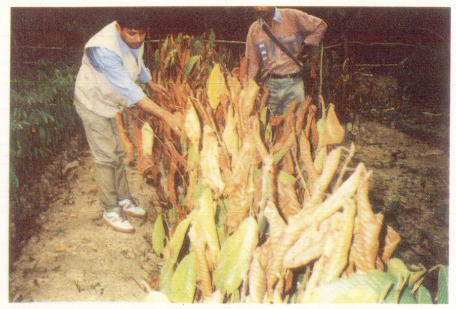
Folior blight attack in Dipterocarpus retusus nursery in Digboi, Assam