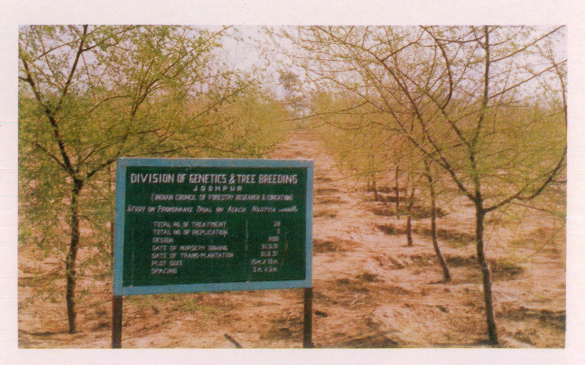
Provenance trial of Acacia nilotica