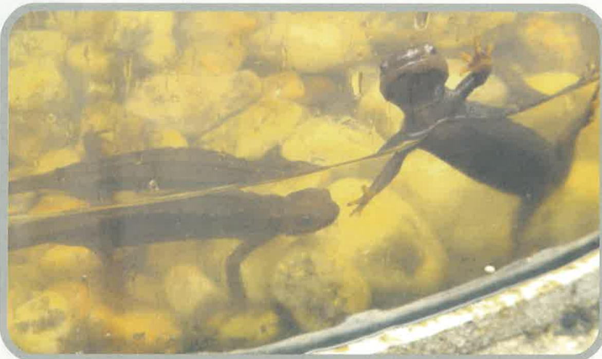
First ever captive bred Himalayan salamander at Padmaja Naidu Himalayan Zoological Park, Darjeeling