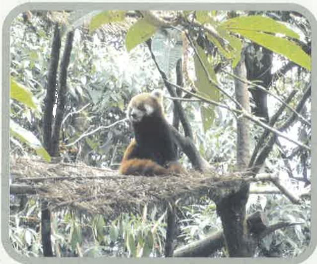
Captive bred Red panda at PNHZP Darjeeling

The Sub-Committee on Conservation Breeding met on 24.5.2005 and again on 15.9.2005 during the year. Sub-Committee recommended that endangered wild animal species with less than 2500 animals left in the wild and less than 100 animal of the species in captive conditions will be taken up for planned conservation breeding in Indian Zoos. Two-four Zoos in the natural distribution zone of the identified species will participate in the conservation breeding programme whereas the off-display conservation breeding facilities will be created in one-two Zoos in the