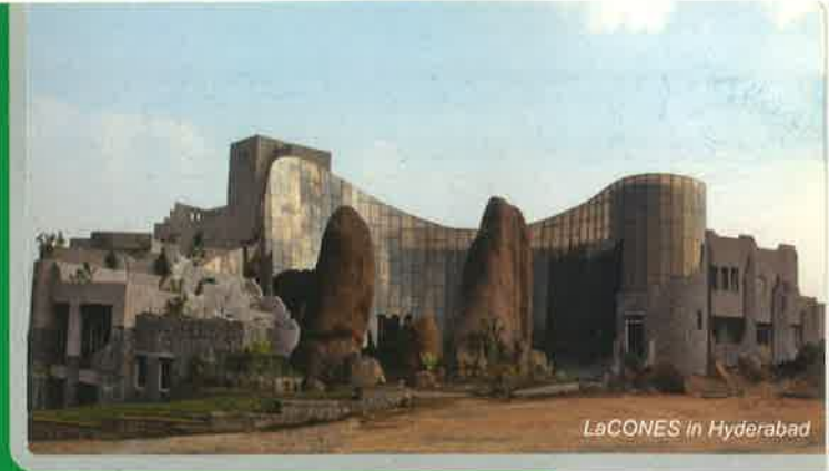
LaCONES in Hyderabad