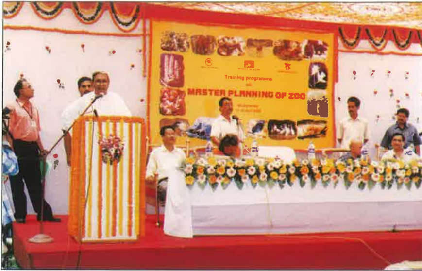
Training Programme on Master Planning of Zoos for Director's and Managers of Zoos in India

organized at Nandankanan Zoological Park, Bhubaneswar during April, 2006 in collaboration with Wildlife Institute of India, Dehradun. The training programme for Zoo Veterinarians was organized at Bareilly from 5 th to 11 th March, 2007 in collaboration with Indian Veterinary Research Institute, Izatnagar. Two weeks training programme for middle level Zoo personnel was organized at Arignar Anna Zoological Park, Chennai from 9 th to 18 th November, 2006. Wildlife Institute of India coordinated the training programme. Short term training programmes for Zoo keepers were organized at Kanpur, Bhubaneswar, Mysore, Ahmedabad and Guwahati on regional basis in regional languages. Special training programme for Zoo keepers of the high altitude Zoos was also organized at Padmaja Naidu Himalayan Zoological Park, Darjeeling during the year.