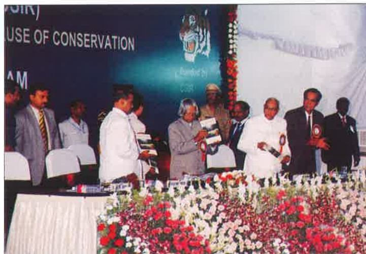
Inauguration of LaCONES by Hon'ble President Dr. A.P.J. Abdul Kalam

National Studbooks of endangered wild animals species in Indian Zoos has been given to Wildlife Institute of India, Dehradun. The project is of five years. The total fund involvement is of Rs. 22.20 lakhs. The Zoo at Alipore, Kolkata has been given funds under small grant fellowships for preparing conservation breeding management plan for Thamin deer whereas Padmaja Naidu Himalayan Zoological Park, Darjeeling has been provided funds to work on behavioural study and enclosure enrichment for Himalayan black bear. Nandankanan Zoological Park, Bhubaneswar has been awarded studies to work on endo and ecto parasites in Zoo animals. The study is of three years duration, costing Rs. 6.00 lakhs. The Zoo at Darjeeling has again been asked to work on record keeping in Indian Zoos whereas Kanpur Zoo will be preparing disaster management plan for Indian Zoos under the small grant fellowship scheme. National Zoological Park, New Delhi has been provided funds for preparation of a manual on transport cages for wild animals.