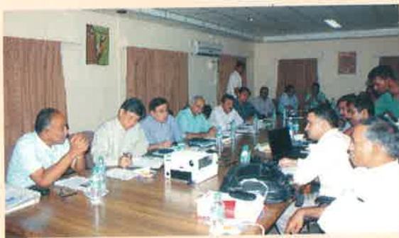
Coordination meeting on Lion-tailed macaque