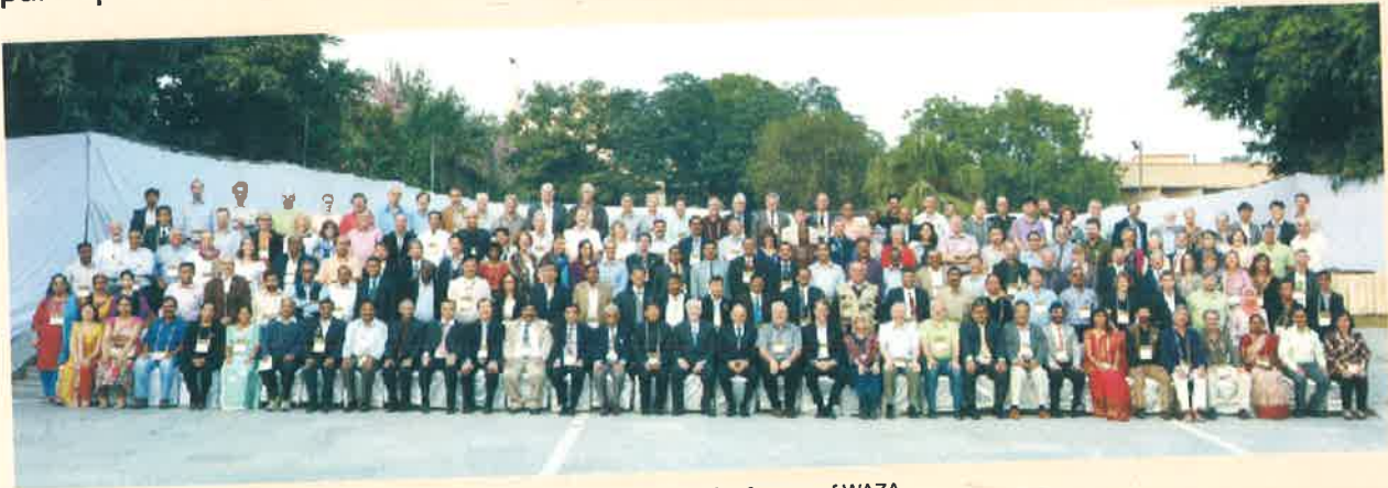
Participants of Annual Conference of WAZA

After the concluding ceremony on 2nd November, participants were provided with an opportunity to visit the National Zoological Park, New Delhi so as to showcase the faunal biodiversity of the country followed by a 'Light & Sound Show' at Old Fort in the evening. In the end participants of the CBSG and World Association of Zoos and Aquariums (WAZA) gathered together at Hotel Ashoka, New Delhi for dinner, a farewell to the CBSG participants and an Ice- breaker welcome to WAZA participants.