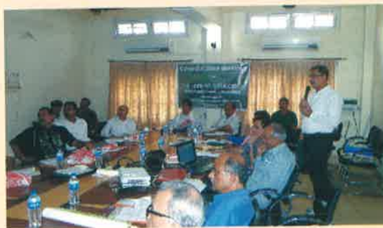
Coordination meeting on One horned rhinoceros