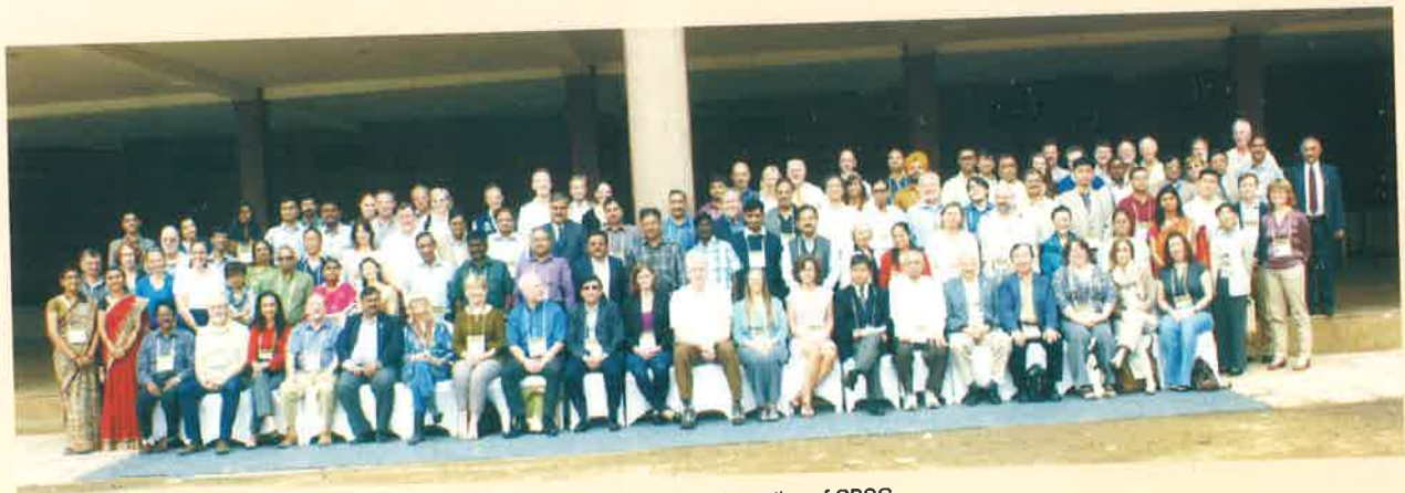
Participants of Annual meeting of CBSG